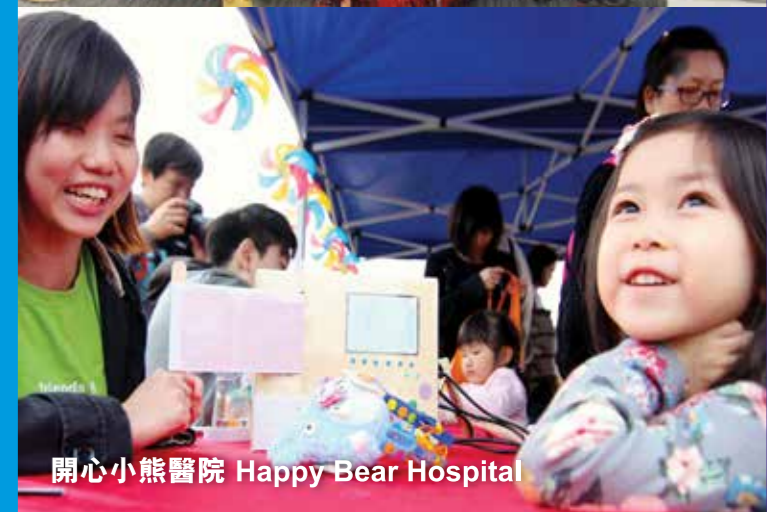
開心小熊醫院 Happy Bear Hospital