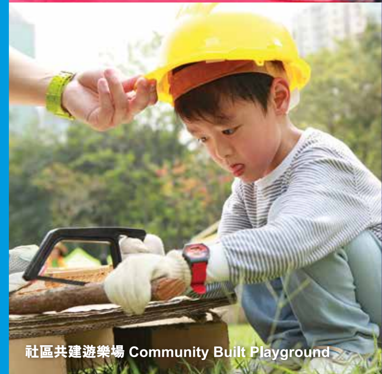
社區共建遊樂場 Community Built Playground