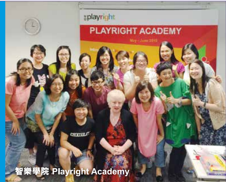
智樂學院 Playright Academy

Conducting playground safety compliance assessment and providing on-site inspection of play equipment to enhance the safety & quality levels of existing or new play environments.