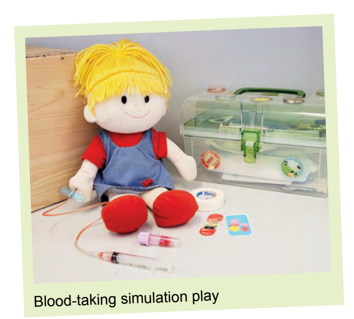
During the telephone conversation, the hospital play specialists came to understand that Chi-kwan's greatest fears were blood taking and intravenous injection. Although Chi-kwan was experienced and had previously learned about the procedure through medical simulation play, when fear struck, she would still require hospital play intervention.

A MAG3 scan is one type of imaging test that uses special equipment to assess the kidney functions, such as blood flow and urinary excretion. Before the examination, a radiopharmaceutical called Mercaptoacetyltriglycine (MAG3) will be administered through intravenous injection. It is a form of tracer to make the scanned images clearer and it can be excreted from the kidneys through urine.