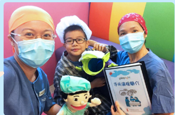
Accompany the paediatric patient to provide encouragement for ease of mind