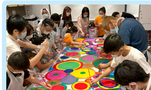
Create chance for paediatric patients & their families to enjoy circle painting with hospital staff

Create mutual support opportunities outside hospital