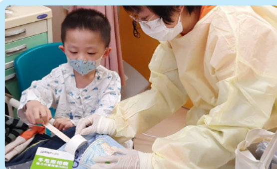
Provide on-day preparation play