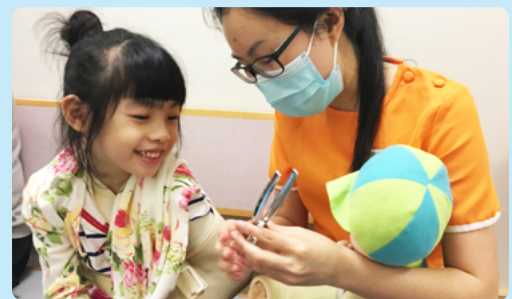
Allow the paediatric patient to express any questions and worries during procedural play