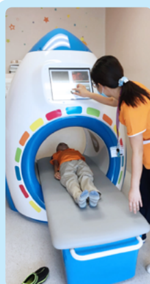
Support a paediatric patient to rehearse in a MRI mock scan