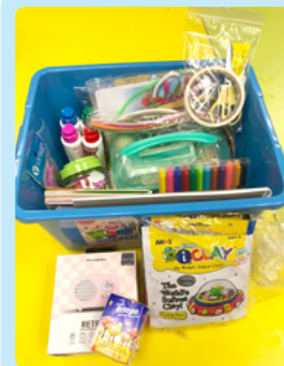
A box set with expressive materials & tools for children & siblings