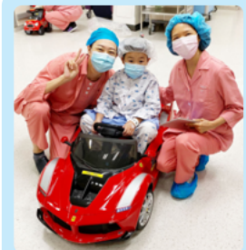
Work closely with healthcare team to create a playful atmosphere, like riding a car to the operation theatre