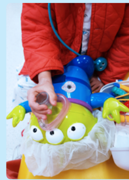
Provide play for experiencing the procedure