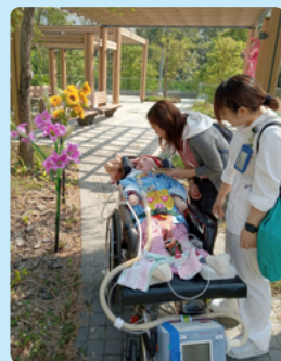
Arrange a walk in the garden with healthcare professionals