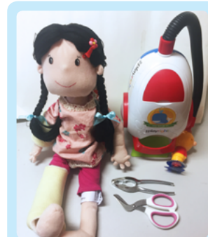
Our tailor-made cast removal tools is designed for paediatric patient's exploration