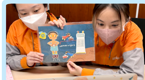
Prepare a paediatric patient for surgery during the pandemic