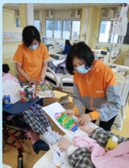
Provide play activities regardless of any physical challenges