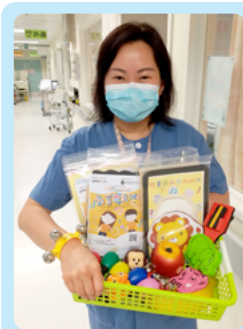
Different play materials are delivered by our working partners in the ward

"Wawa is discharged" is a story book with plenty of play materials for children to reconstruct the isolation experience & support their psychological needs