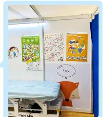
Poster on wall for distraction play