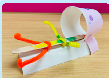
Make a MRI machine craft out of simple art materials to let paediatric patient at home familiarize with the procedure