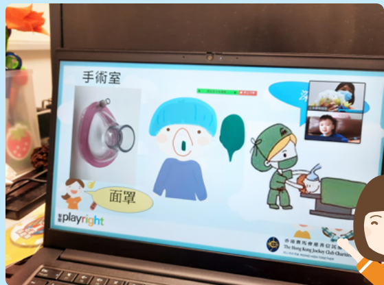
Use cartoon to talk about the sequence and sensory information of the procedure during home preparation