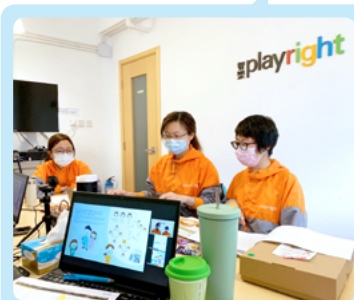
Engage online in interactive play & build relationships with paediatric patient