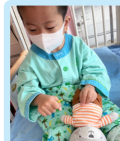
Create a tailor-made doll for familiarization with medical tools