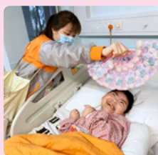
A hospitalized child enjoys sensory play just like any other child