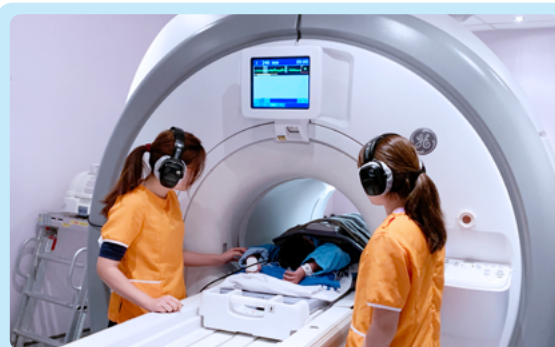
Accompany a paediatric patient who feels insecure in a MRI procedure