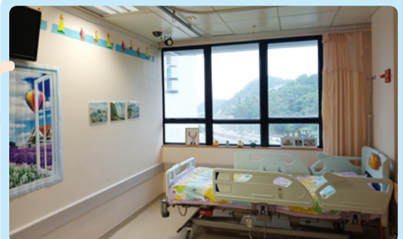
Decorate the ward to feel like home