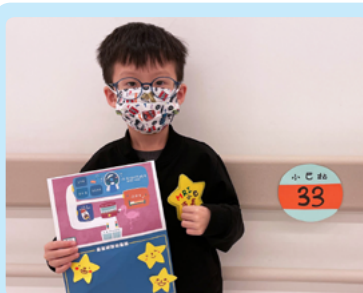
Create a minibus mission to engage the paediatric patient with healthcare professionals by a star token of the MRI route