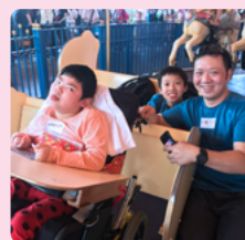
Organize an outdoor family day at the theme park