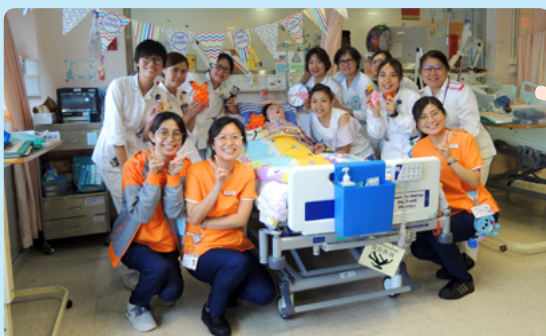
Every birthday is a milestone that is worth to celebrate