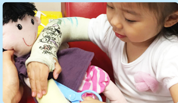
Go through the cast removal procedure in a child-friendly way

On-day support 15 mins to 30 mins before